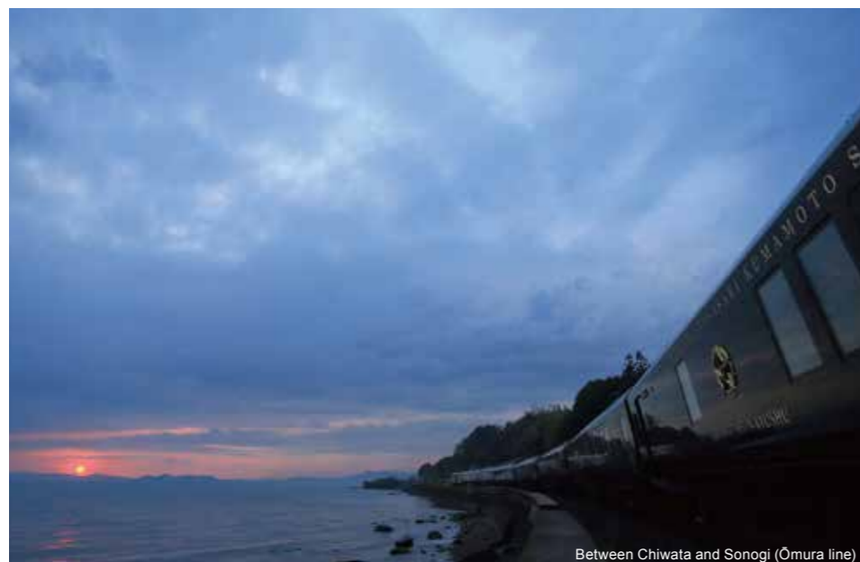
Between Chiwata and Sonogi (Omura line)